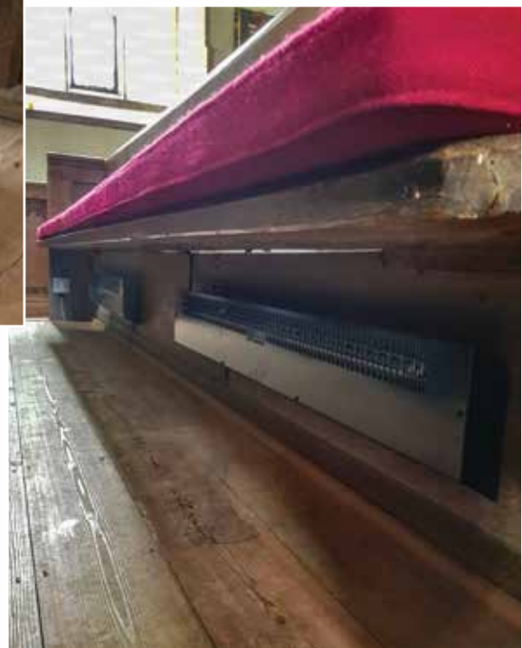
Pew heaters providing economic heating in St James Church, Egerton, Kent