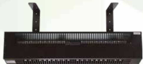
PHB optional suspension brackets