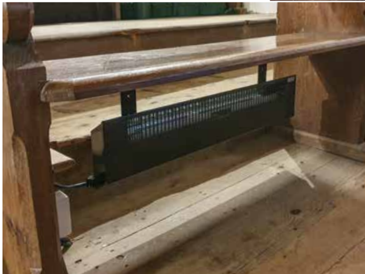
Pew heaters keeping a congregation warm in a Norfolk Church