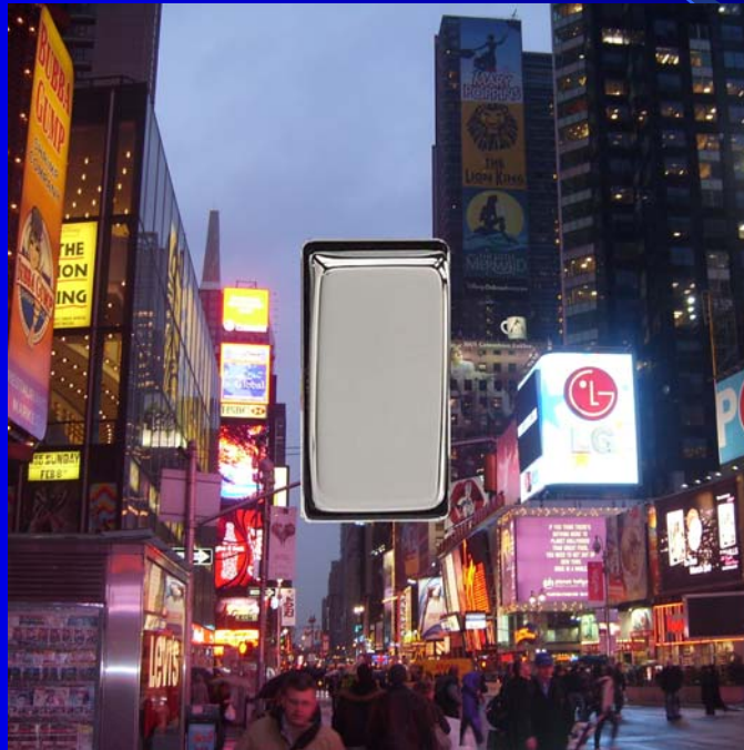
Times Square New York February 2009