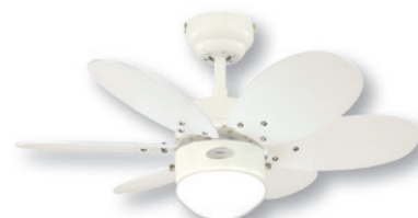
Colors of Young Generation/ Colors of Youth, white/maple