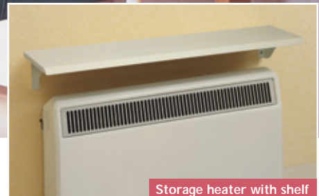
Storage heater with shelf