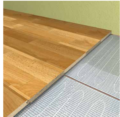
F Series foil heating mat specifically designed for laminate and engineered wood floors

For large rooms it is common practice to use more than one foil mat. In these circumstances the mats are usually connected in parallel and controlled by a single thermostat. When the combined load exceeds the switching capacity of the thermostat, it will be necessary to incorporate a contactor into the control circuit. Alternatively, BN Thermic's Wireless Control System allows several heating mats to be controlled without a contactor (see page 14)