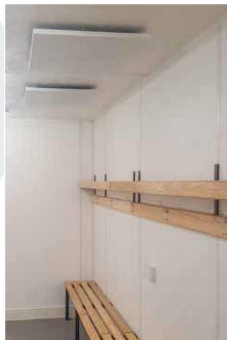
RP radiant panels in a changing room making best use of available space