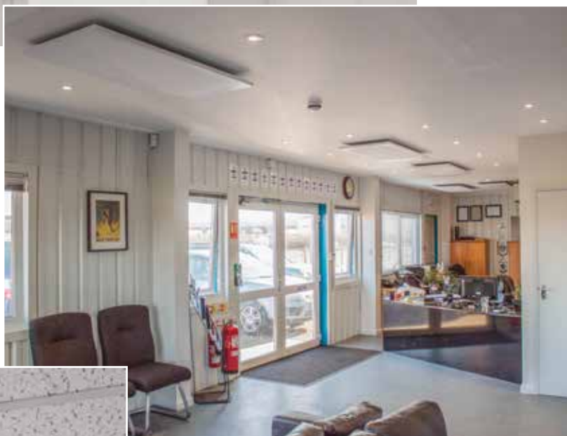
RP-06 radiant panels providing an economic and stylish means of heating a flying school in Sussex