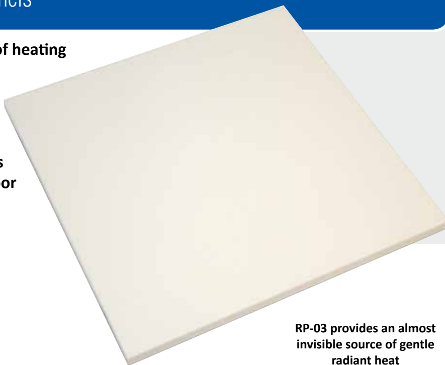
RP-03 provides an almost invisible source of gentle radiant heat