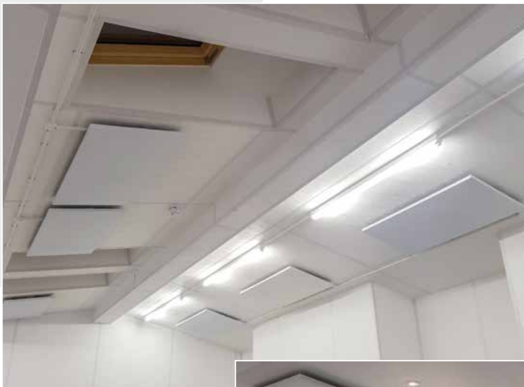
RP radiant panels ceiling mounted in a cricket pavilion