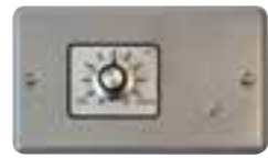
VR-1 Dimmer switch for fine adjustment of heater output

In specific applications there may be a need to adjust the intensity of the heat output from a HWP patio heater. The BN Thermic VR-1 provides adjustment between 0% and 100% of heater output. It also has a definite 'click' to off allowing it to be used as an on/off switch. The VR-1 is a surface mount device but is not suitable for outdoors installation. For full details of the VR-1 see page 69.