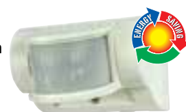
WH-402 Energy saving device ensuring that heating is switched off when an area is unoccupied