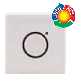
TS-3 Timer Energy saving timer weather-proof to IP66

The WH-402 has a switching capacity of 16A. It can therefore directly switch a combined load of up to 3kW. Larger loads or 3-phase loads can be switched via a suitably rated contactor (see page 64).