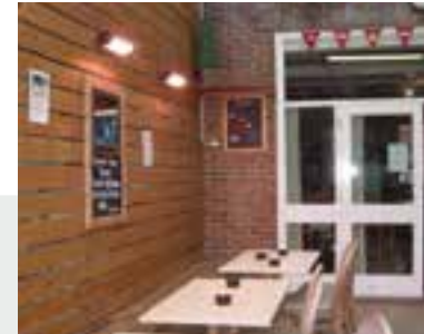
HWP2 patio heaters providing instant economic heat at the Romans Pub, Southwick, West Sussex.

Use the following diagram and table to select the optimum mounting position. In an exposed location and where mounting height is relatively high, we recommend installing a 2kW, 3kW or 4.5kW heater.