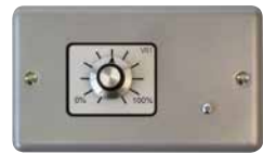
VR-1 Dimmer switch for fine adjustment of heater output

The WH-402 has a switching capacity of 16A. It can therefore directly switch a combined load of up to 3kW. Larger loads or 3-phase loads can be switched via a suitably rated contactor (see page 68).