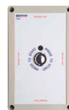
TS-5 Weatherproof Timer for larger loads