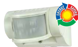
WH-402 Movement sensor