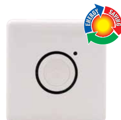
TS-3 Timer Energy saving timer weather-proof to IP66

The BN Thermic WH-402 is a compact, surface mount, weatherproof device conforming to IP55. The WH-402 will detect movement in an area up to 12m from its mounting position in a 180° arc. Both distance and angle of detection can be reduced if required. Once movement has been detected, the heating will be switched on. If no further movement is detected within