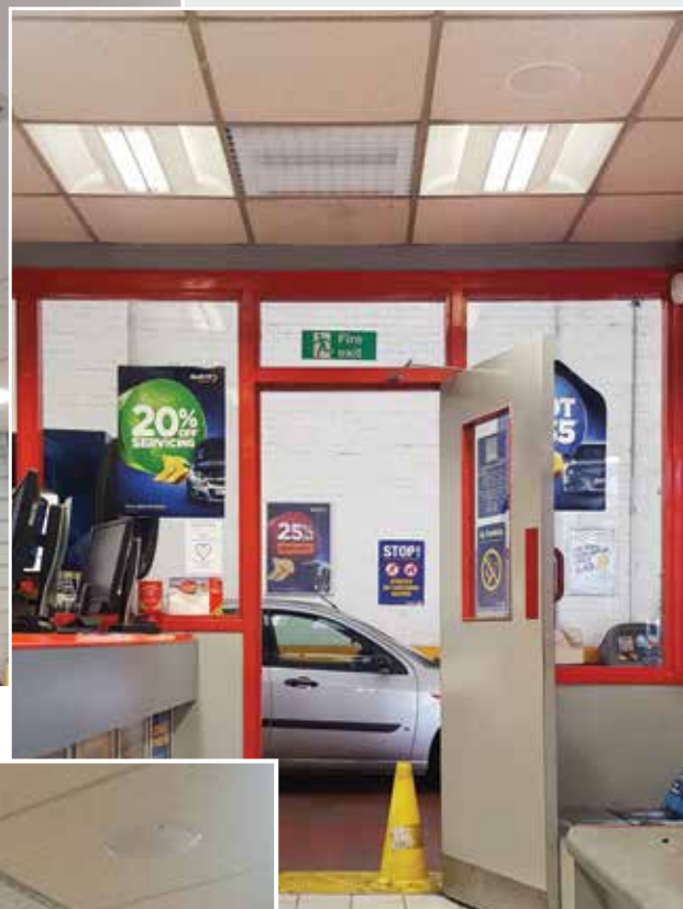
An SCH fan heater provides simple and reliable heating in a car service reception area