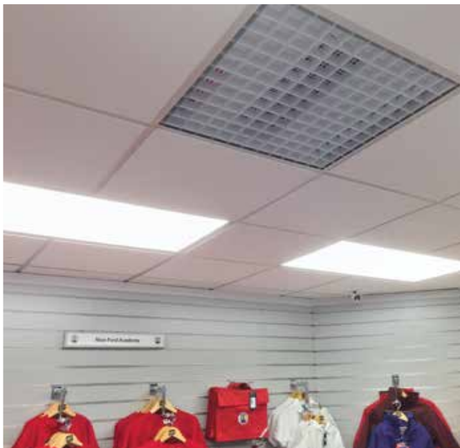
SCH heater installed in a school outfitters