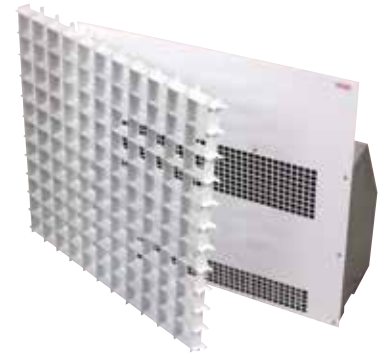
3kW and 4.5kW heaters and grille