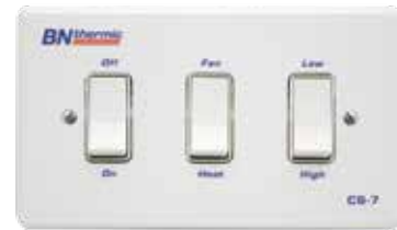
CS-7 switch for high/low/fan only settings