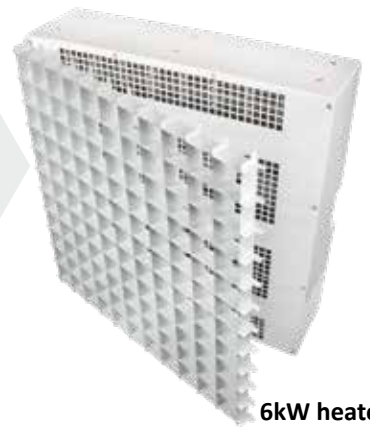
6kW heater and grille