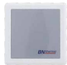
RST-TP Energy Saving Tamperproof Thermostat

The RST-TP's tamperproof design prevents casual adjustment of the temperature setting.