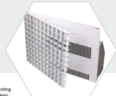
SCHG-30 and diffuser designed for quick installation into a 600 x 600 ceiling grid