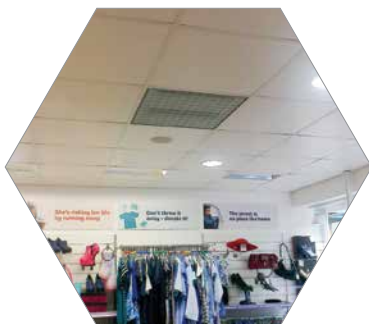
SCHG-30 installed in a charity shop in Calverton, Notts