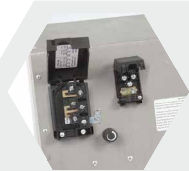
Rear view of SCHG-30E – rear mounted terminal enclosures allow quickest possible electrical connections

The RST-TP's tamperproof design prevents casual adjustment of the temperature setting.