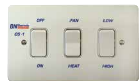
CS-1 Controller Providing on/off/high heat/low heat/fan only settings

The CS-1 controller can be used with all three heaters in the SCH range.