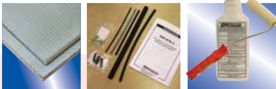
F-Board-6 and -10