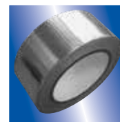
AL-50 Aluminium Tape