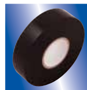
PF-T Fixing Tape