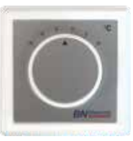
FST2-IN Thermostat for indoor use