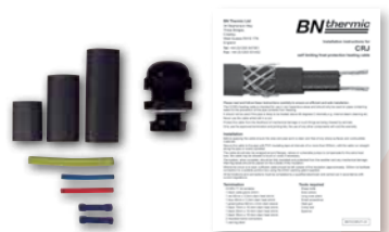
CRJ-T Termination Kit Prepares cable for electrical connection and seals the 'far end'