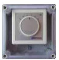
FST2-EX IP65 Thermostat for outdoor use