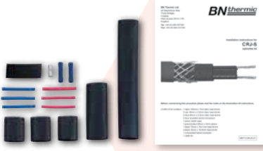
CRJ-S Splice kit for joining two lengths of cable or for making a 'T' joint