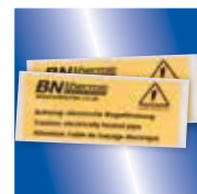
PF-L Caution Labels