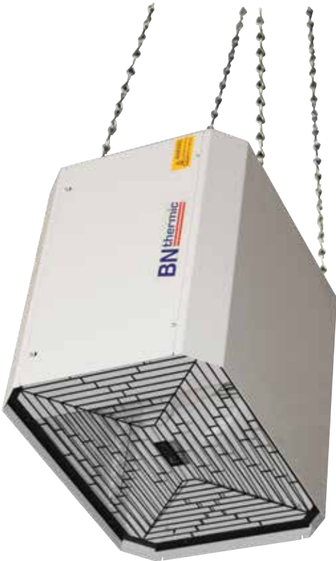
OUH2 Unit Heater suspended using hooks provided

*Noise levels are factory tested not laboratory tested