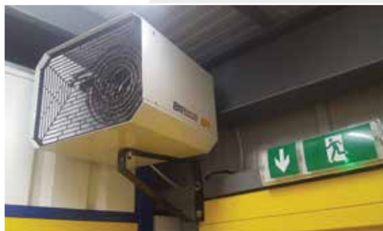
20kW heater providing background heat in a storage facility in Kent