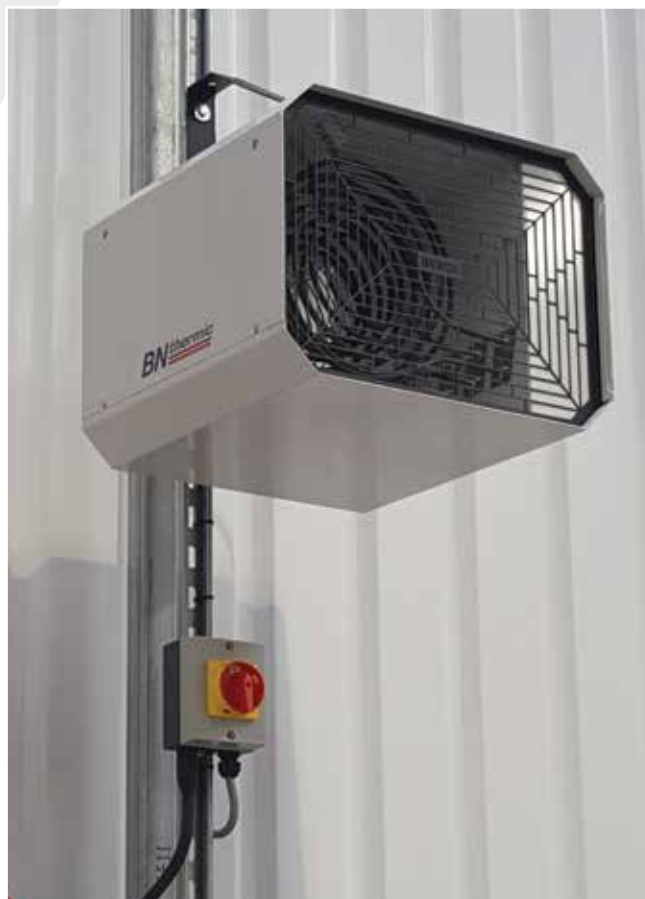
OUH2 wall mounted in a warehouse in Axminster, Devon