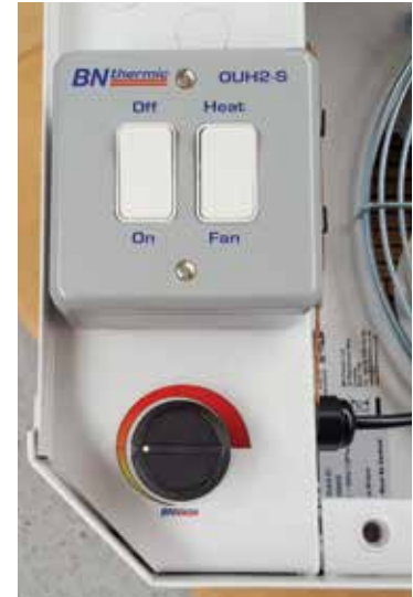
OUH2-S control switch fitted to a heater. Can be wall mounted if preferred