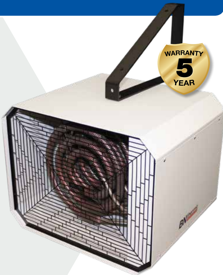
OUH2 Unit Heater Robust, Rugged, Reliable