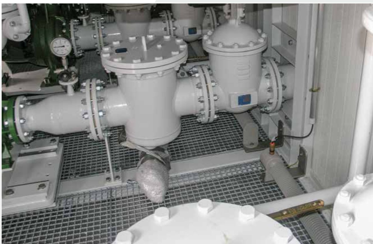
TX ATEX approved heaters installed in a hazardous area