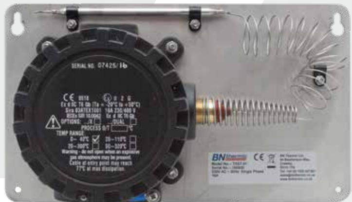
TXST-01 ATEX approved thermostat for use with hazardous gases