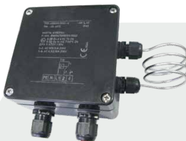
TXST-02 ATEX approved thermostat for use with hazardous gases and dusts