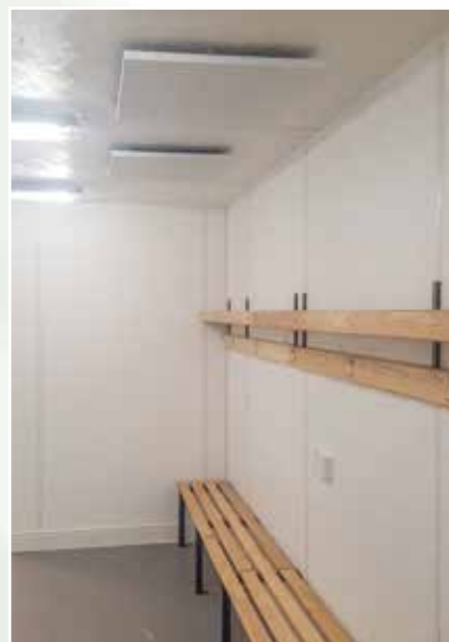
RP radiant panels in a changing room making best use of available space