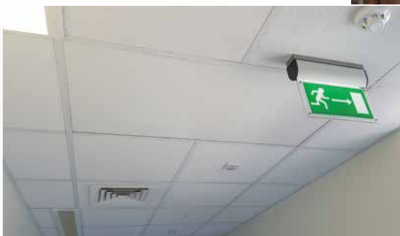
Radiant ceiling panel providing an almost invisible source of heat in a hospital corridor