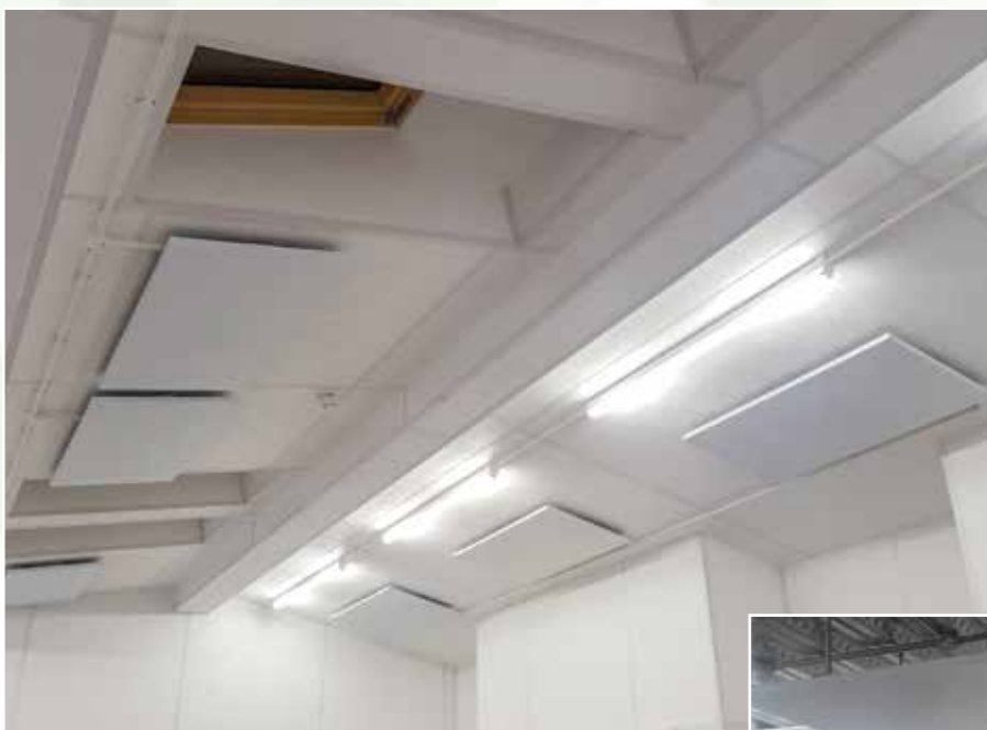
RP radiant panels ceiling mounted in a cricket pavilion in Essex