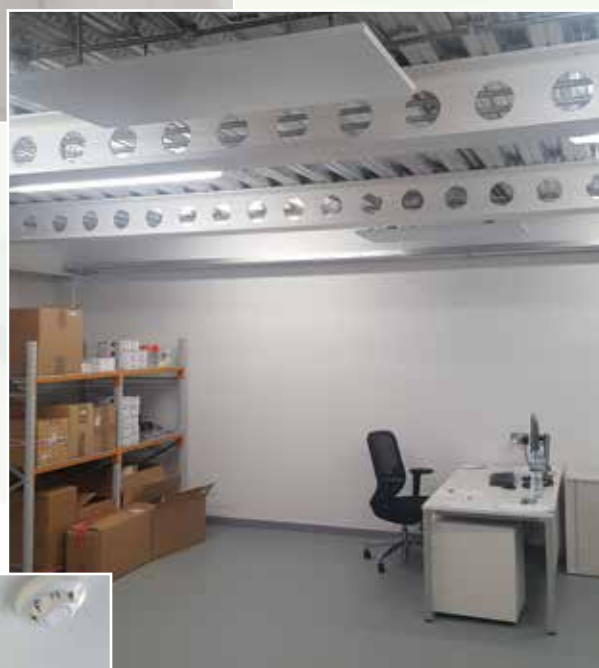
RPs providing unobtrusive heating in a prestige British sportscar facility