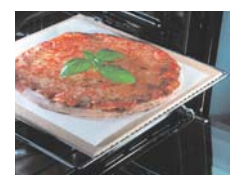
Optional BPS1 pizza stone