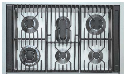
6 burner gas hob