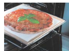
Optional BPS1 pizza stone