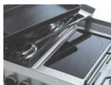
Fry top on ceramic