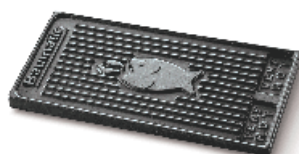
Optional BTGRID Cast iron Double-sided griddle plate