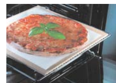
Optional BPS1 pizza stone