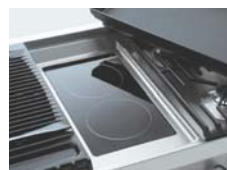
Fry top on ceramic