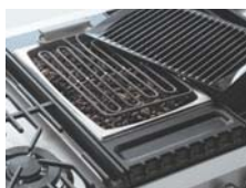
Barbeque lavastone grill