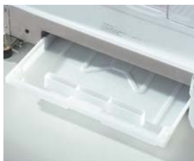
Defrost water trap