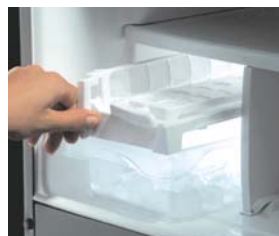
Twist ice maker