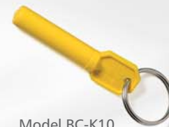
Model BC-K10 Model BC-K50