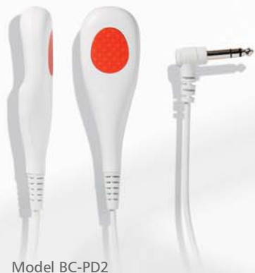
Model BC-PD2 Model BC-PD3