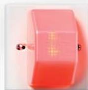
Model BC-OD (illuminated)