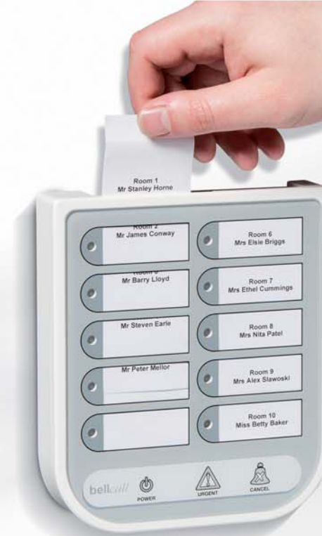
Simple identification label replacement