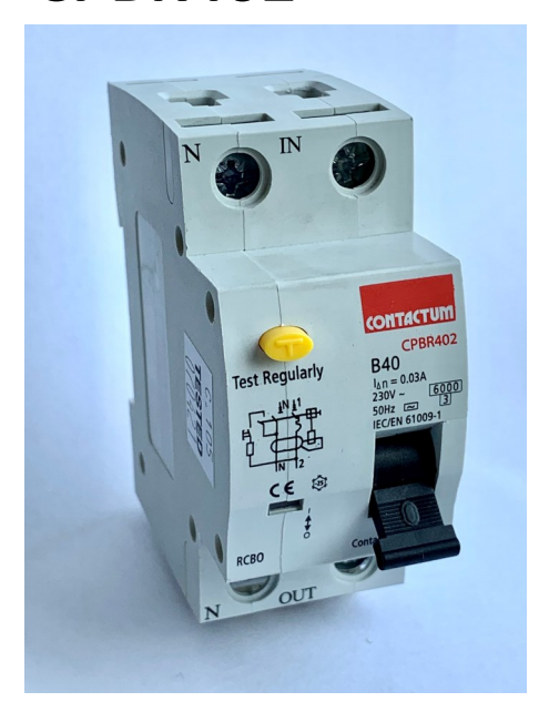
40A 6KA B Curve DP RCBO