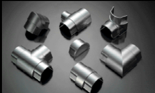
Selected D-Line accessories