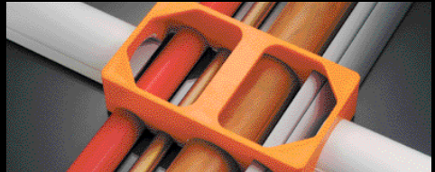
Cutting block for use with D-Line lengths