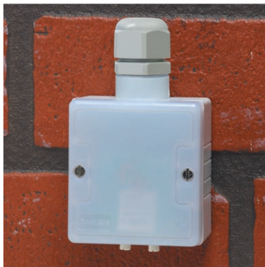
Order code: DUSW