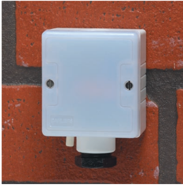
Order code: TWSW