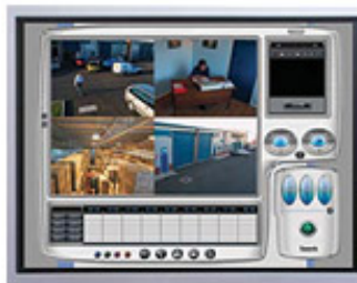
SEARCH (QUAD MODE)