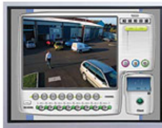
CLIENT (SINGLE SCREEN MODE)