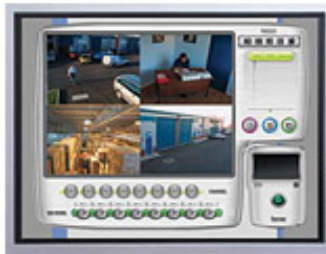
SERVER (QUAD MODE)