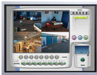
CLIENT (QUAD MODE)