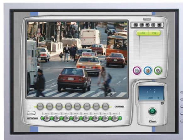
CLIENT 300 (FULL SCREEN MODE)