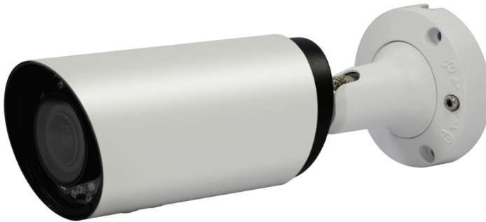
SHDVC2812VFB(W/G) 4 MEGAPIXEL BULLET CCTV CAMERA