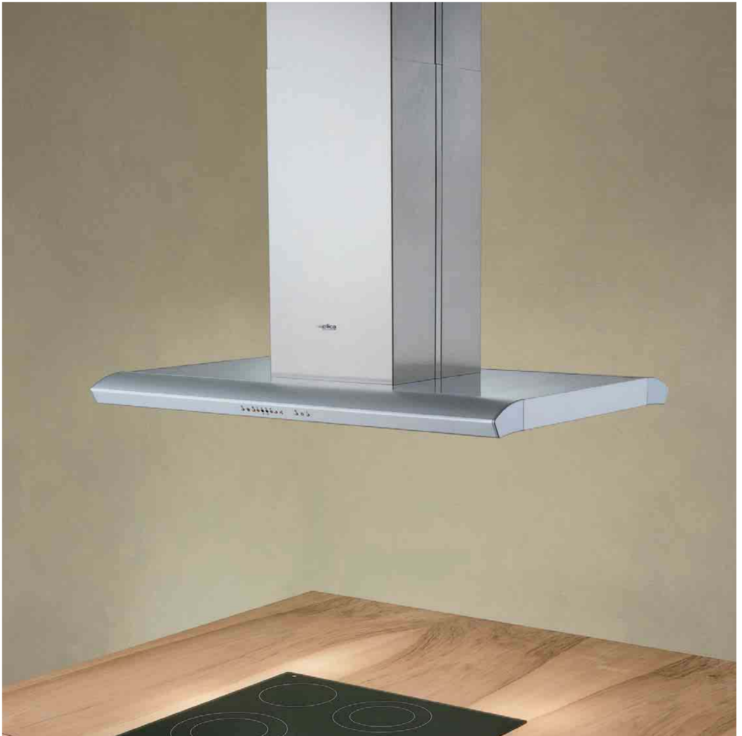
Aluminose Touch Control

Aluminose's simplicity of design allows it to blend with every style of furnishing. This elegant island hood comes in three versions: the luminosity of aluminium is combined with either glass, silver or black, to harmonise perfectly with your kitchen, whatever the style.