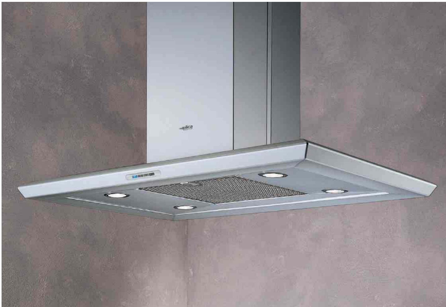
Frame Light Soft

Frame was conceived to harmonise with the spaces of the domestic interior, and for people who appreciate its elegant contribution to the kitchen environment. This island hood's extraordinary performance endows your kitchen with the airy and relaxing atmosphere you've always wanted.