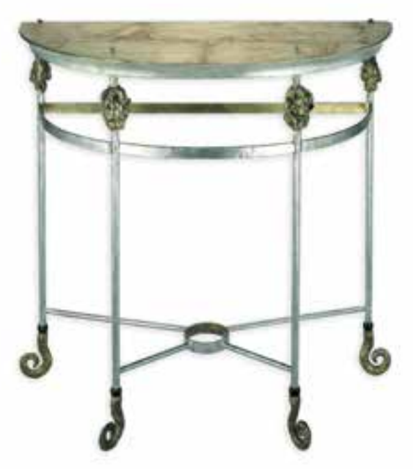
FB/ARMORYTABLE (CON 1050) DEMI-LUNE CONSOLE TABLE

GOLD LEAF AND GLAZED DEMI-LUNE TABLE TOP WITH SILVER AND GOLD LEAF SCULPTED DECORATIVE FACE FRAGMENTS ON LEGS, GILDED SWIRL FEET.