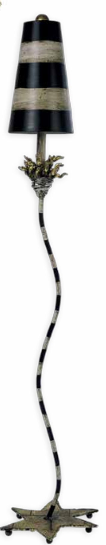
FB/LA FLEUR/FL (FL1009) FLOOR LAMP

GOLD LEAF SQUARES SIMULATE A NEW ORLEANS SIDEWALK TO FORM THE DECORATIVE PLATE BASE. GOLD LEAF BLOSSOM BURSTS FROM BLACK AND PUTTY STRIPED STEM. BLACK AND PUTTY STRIPED SHADE, TOPPED WITH GOLD LEAF BALL FINIAL.