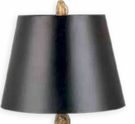
FB/RODRIGUE/TL (TA1134) TABLE LAMP

SMALL, BELL SHAPED TABLE LAMP IS TOPPED BY A GOLD FLEUR DE LIS AND A BLACK SHADE WITH GOLD SPATTER ACCENTS