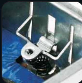
Fixing lug retracted

Copies of all the test data are available on request.