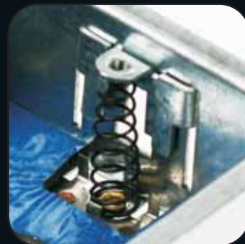
Fixing lug locked in position