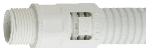
FPL Conduit with Flexilok fitting