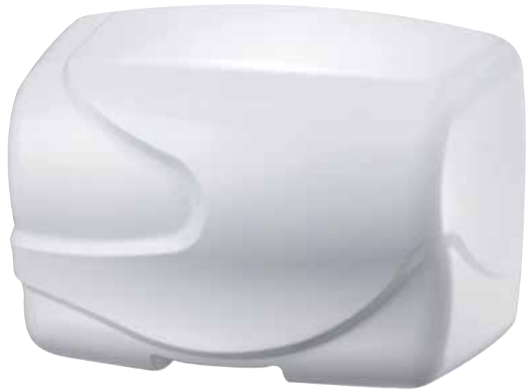
Painted cast aluminium.