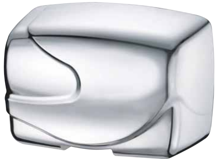
Chromed cast aluminium.