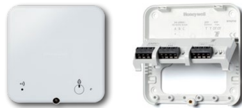
Receiver box back plate

The wireless model is supplied with a new receiver box, redesigned with a flip-up wiring bar to simplify the installation process.