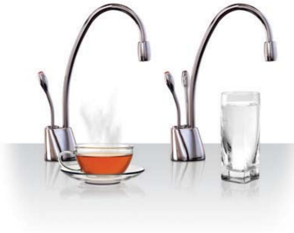
Both models available in brushed steel