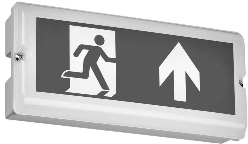
IP65 3W LED EMERGENCY BULKHEAD