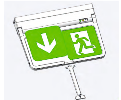
Select the direction