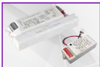
Quick Plug-in & Screwless Emergency Kit (LTEM) and Microwave Sensor (LTMS) Available