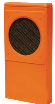
FG701 Glassbreak tester