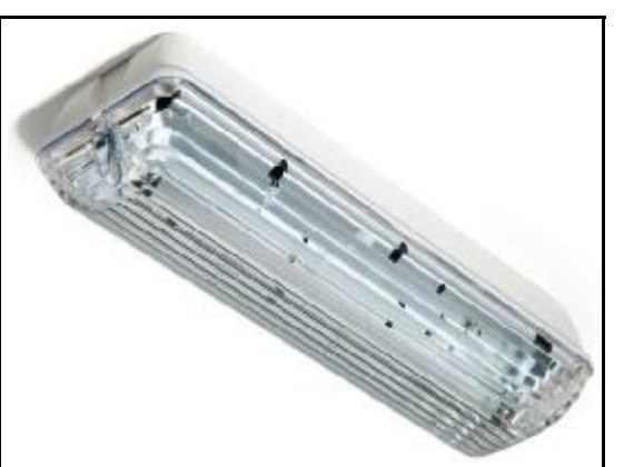
TLC Surface Mounting Bulkhead