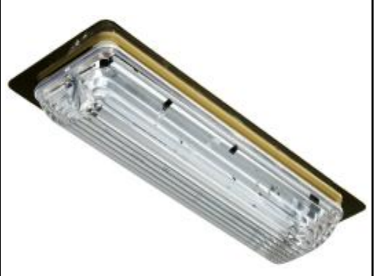
TLC Bulkhead with Brass Semi-Recessing Trim