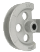
BENF20, BENF25, BENF32 Bending Former 20mm Also fits HILMORE EL20, EL25, EL32, CM35 & CM42.