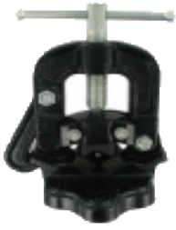
BENPV 2' / 50mm Pipe Vice Also fits HILMORE EL25, EL32