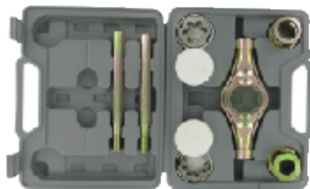
DIE Stock & Dies Set Sizes: 20mm, 25mm