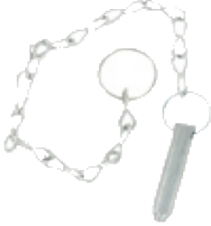
BENSP Safety Pin Also fits HILMORE EL25, EL32, CM35 & CM42