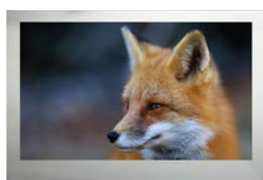
Mirror - PV27MF-A