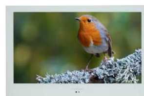
White - PV27WF-A