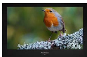
Black - PV27BF-A