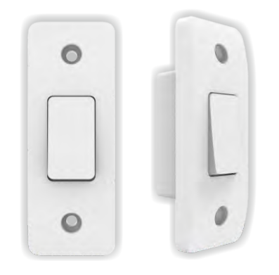
Architrave Wireless Switch

Read instructions carefully before installation