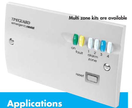
Multi zone kits are available

Timeguard can be contacted on 020 8452 1112, or log on to: www.timeguard.com