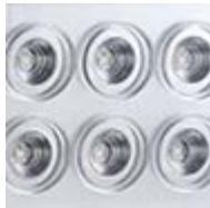
Including LED system