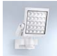
Optional basic light level 10 %