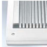
Intelligent LED (ATC) cooling system