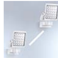
Interconnectable by cable