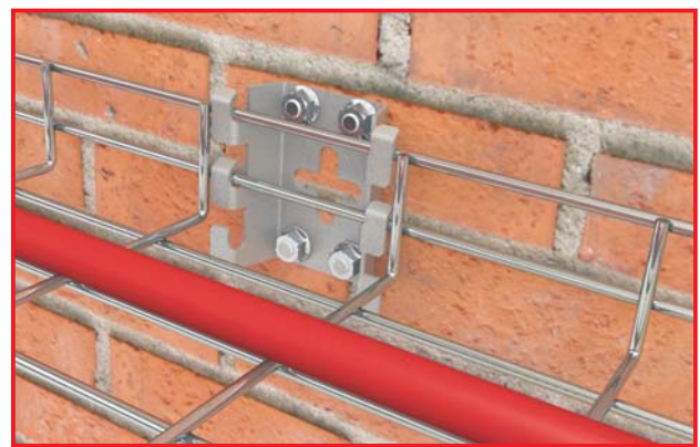
UCB-TC30 Connection Example