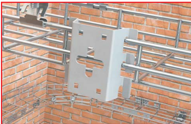
UCB-TC30 Connection Example