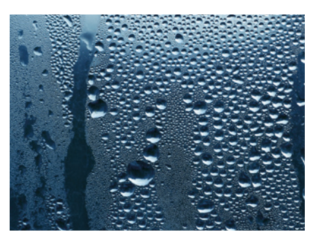
The 'average' family produces approximately 27 pints of moisture per day.

Instead, continuous running extract fans in bathrooms, kitchens and utility rooms work with the natural air flow in the house meaning you have a constant supply of fresh air which prevents mould and contaminants multiplying and spreading, giving you a healthy home, but without the heat loss associated with intermittent fans.