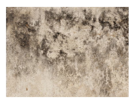
Walls, ceiling, floors & soft furnishings quickly show signs of black mould growth.