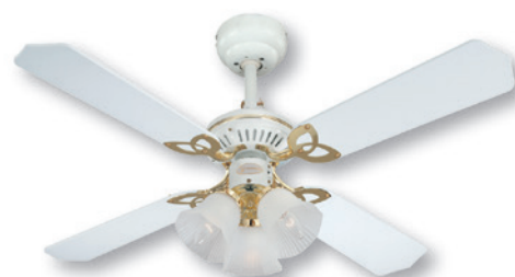
white cane/ white