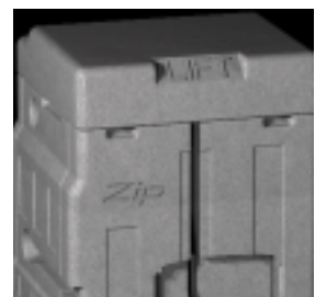
Exclusive compressed high temperature insulation panels