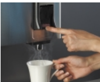
Hydroboil Plus Cool-touch tap gives precise fingertip control