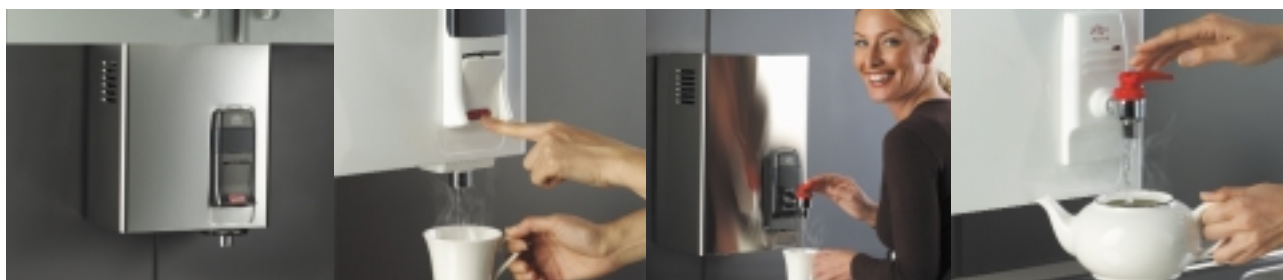
Zip Hydroboil Plus HS301

Zip Hydroboil and Hydroboil Plus over-sink instant boiling water heaters are essential appliances for busy kitchens and come in the widest range of models available to suit every need at home or at work.