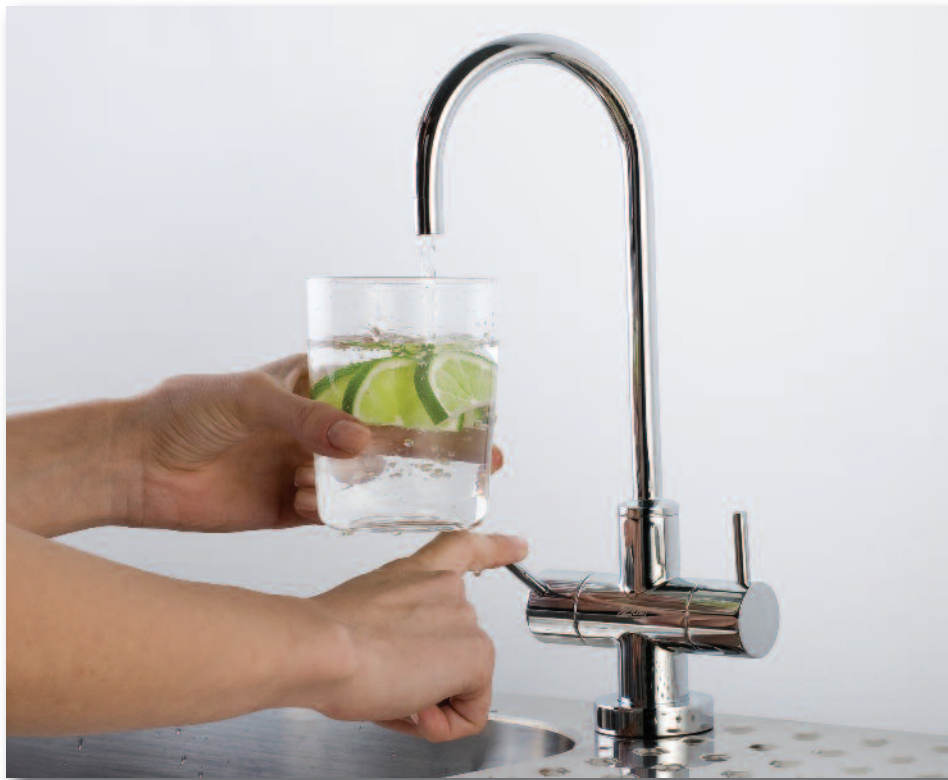
Instant chilled and cold (ambient) filtered drinking water both from the one tap!