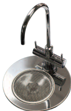
Chilltap Extra on ZT004 Font Kit Assembly for mounting away from sink. A convenient and stylish addition to any kitchen.