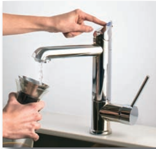
Instant boiling and chilled filtered water

Boiling and chilled filtered drinking water, instantly, PLUS hot, cold or mixed warm water – All from the one tap!