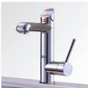
Simplifies kitchen design