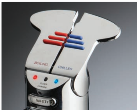
Over-sized levers available for people with restricted dexterity (optional accessory)