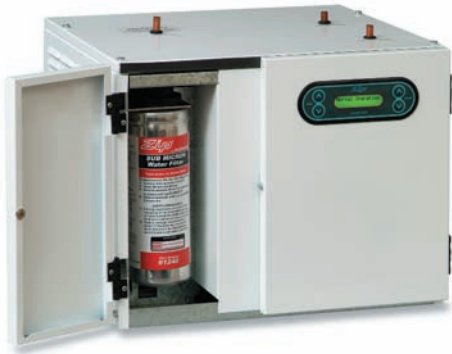
Under-sink operational unit with filter compartment